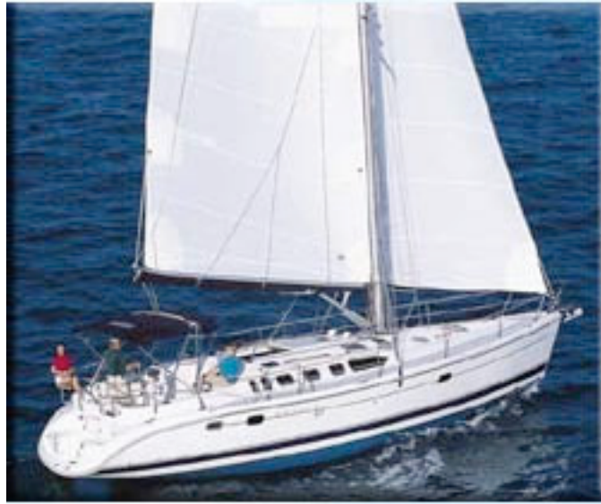
Figure 2. Research vessel Summer Breeze , a Hunter 46 sailboat, 46 foot in length.